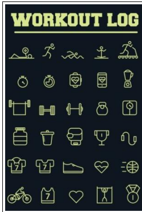
Filesize: 6.5 MB