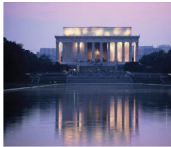
Projections of Education Statistics to 2019