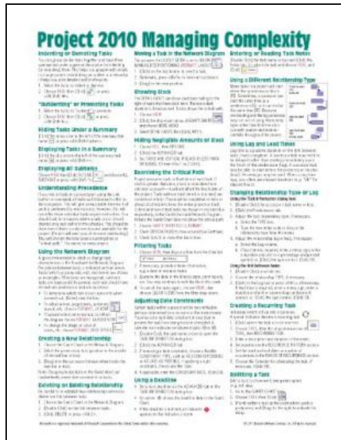
Filesize: 7.07 MB